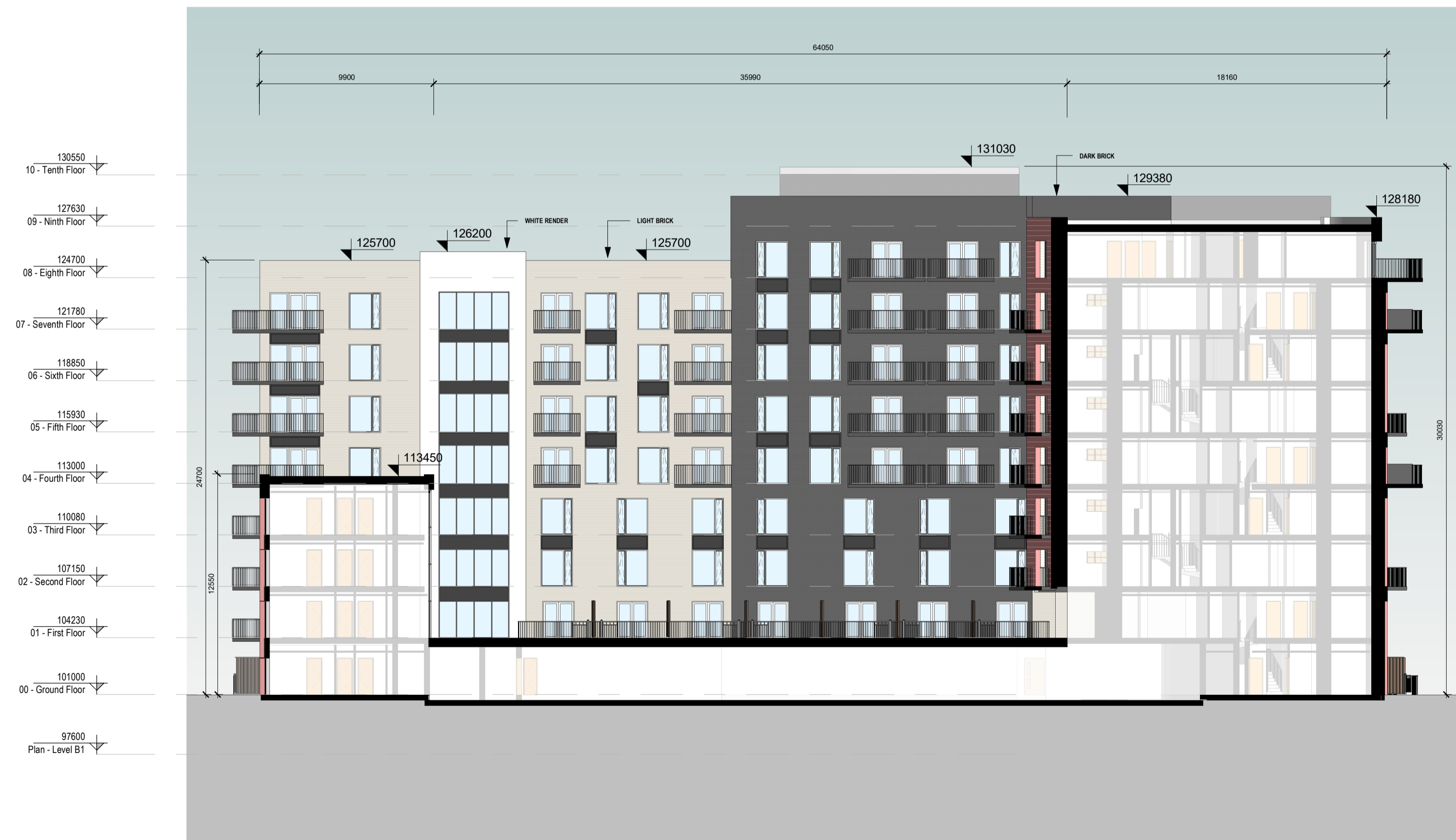
2 Block A - Elevation A8 1 : 200

1 Sarsfield Quay, Arbour Hill, Dublin 7 t: 01 518 0170 e: admin@cwoarchitects.ie Dublin | London | Warwick | Manchester www.cwoarchitects.ie